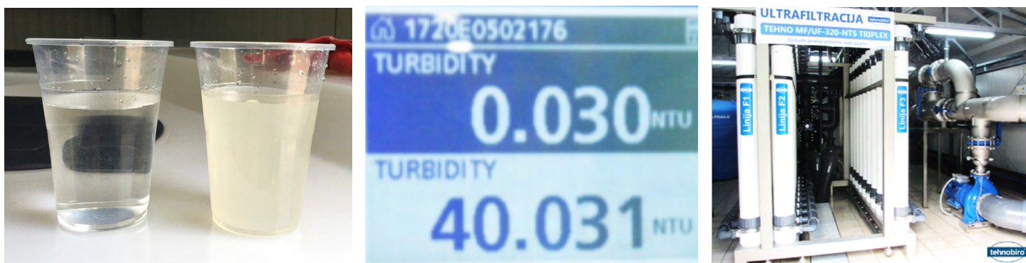
Figure 2. Left. Filtrate and feed UF water. Middle. Turbidity of filtrate (top) and feed water (bottom). Right. Petrinja UF installation.