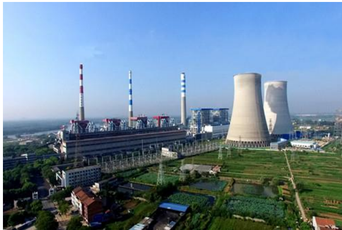
Figure. The bird view of Guodian Hanchuan power plant

Beijing Lucency enviro-tech Co. Ltd, Nanjing branch (Simplified as Nanjing Lucency in the following parts) is a subsidiary of Guodian Technology & Environment Corporation. Nanjing Lucency has investigation & engineering design, construction, and operation capability in the water treatment technology as well as its extended value chain. To date, Nanjing Lucency has completed more than 200 projects in the power plant supply water treatment and industrial wastewater treatment.