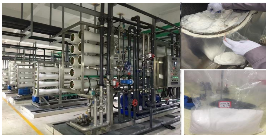
Figure. Nanofiltration / reverse osmosis system and crystalized salt photo