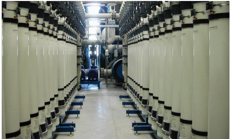
Photograph of two UF skids.