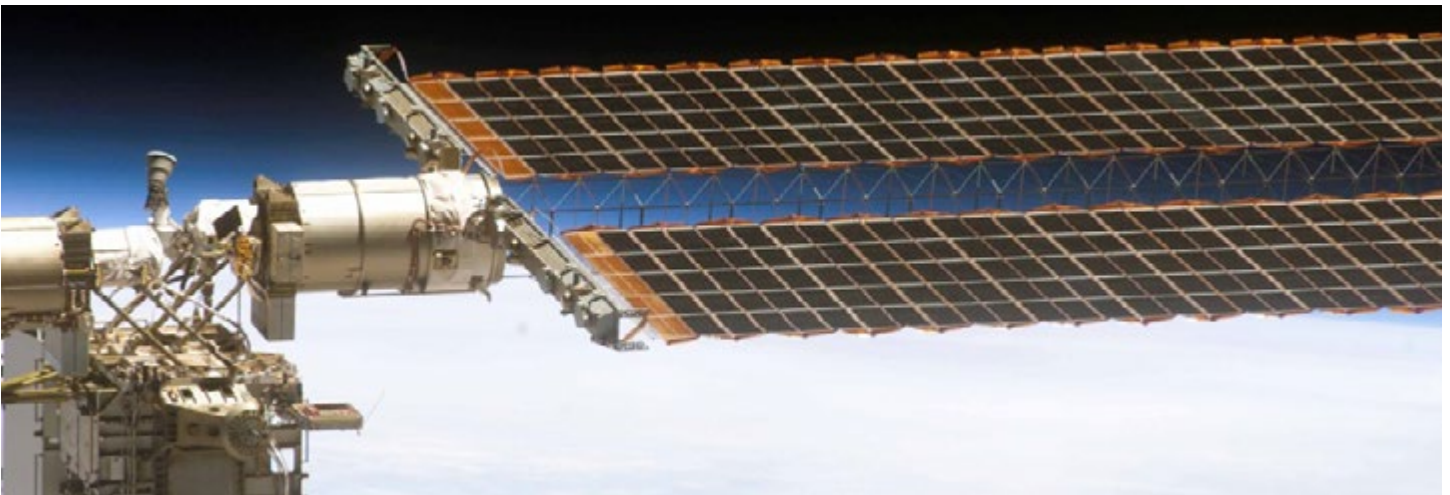
Flat flexible cables made with Pyralux® can be folded or even crumpled without affecting performance, and can be anywhere from a few feet to over 100 feet long.

Electrically insulating films/laminates and adhesive thermal tapes offer excellent thermal conductivity, lower thermal resistance, higher heat dissipation and improved thermal stability during continuous operation.