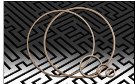
Kalrez® 9500 parts are based on a proprietary crosslinking system which is only available from DuPont.

Kalrez® 9500 also offers outstanding thermal stability, very low outgassing and excellent mechanical strength and is well suited for both static and dynamic sealing applications. A maximum application temperature of 310°C (590°F) is suggested. Kalrez® 9500 can also withstand short-term excursions up to 325°C (617°F). Ultrapure post-cleaning and packaging is standard for all Kalrez® 9500 parts.