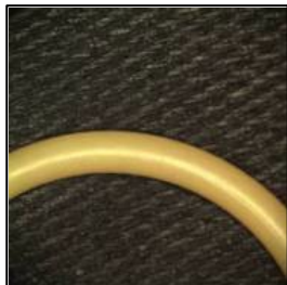
Kalrez® 9100 Poppet Seal

Figure 2. DuPont™ Kalrez® 9100 and incumbent seals after processing 5000 wafers. It was the research center's opinion that the Kalrez® 9100 seals could have continued to function beyond the scheduled PM cycle of 5,000 wafers.