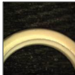
Incumbent FFKM Top Nozzle Seal