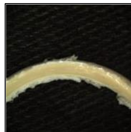
Incumbent FFKM Poppet Seal