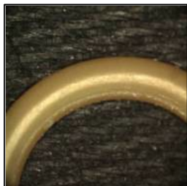
Kalrez® 9100 Top Nozzle Seal