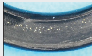
Competitive FFKM O-ring