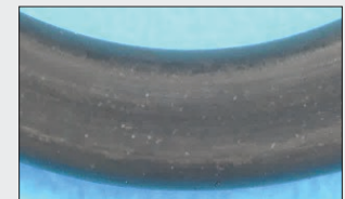
Kalrez® 7375 O-ring