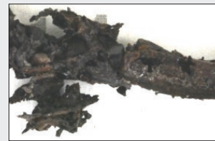
Used Competitive FFKM O-ring