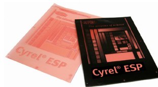
Cyrel® EASY ESP Solvent Engineered Surface

This new platform technology simplifies the prepress process by building digital flat top dots directly into the plate. This results in increased productivity and consistency, offering high ink transfer and vibrant colors, making it a quick and simple process. The plates are available in four versions: