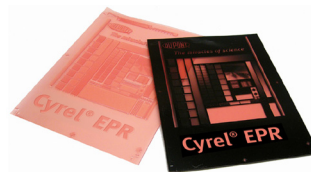
Cyrel® EASY EPR Solvent Smooth Surface