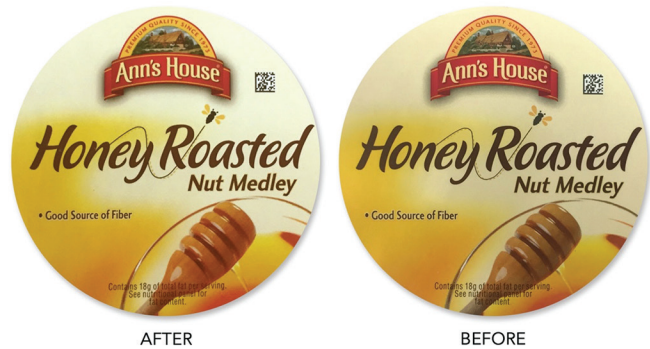
Ann's House Honey Roasted Nut Medley Labels