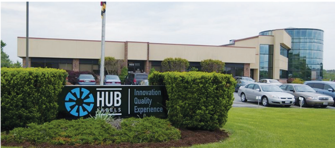
Hub Labels facility in Hagerstown, Maryland