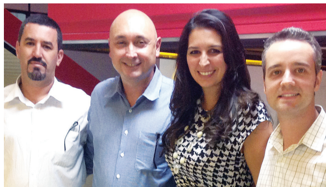
DuPont and Fotograv: Four decades of partnership

For more information on DuPont™ Cyrel® EASY visit www.cyrel.com or call your sales representative.